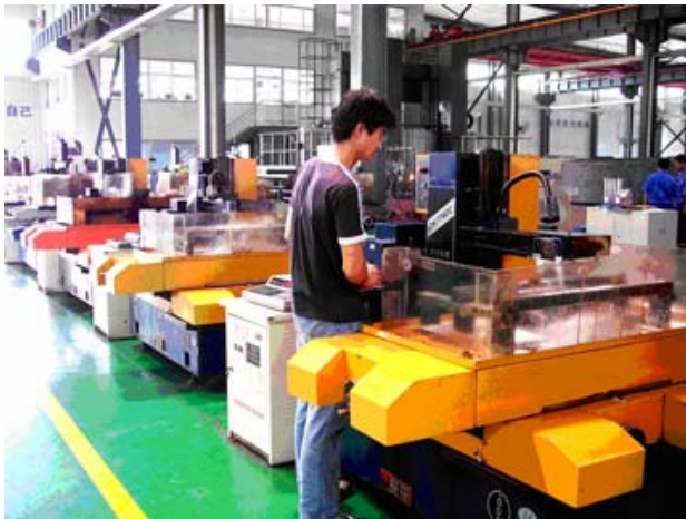
Wire Cutting Machine