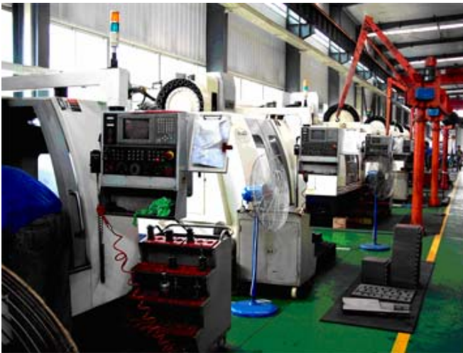
Vertical Machining Center

PGL is pleased to announce its participation and exclusive USA representation for two great machining shops. These shops have approximately 2,000 employees and combined shop floor space of over 450,000 sq. ft. They have been making parts and assemblies for companies like Airbus, General Electric, Caterpillar and many other world class manufacturers. PGL is making this capability available to companies in the United States through our exclusive arrangement. Our shops can serve you whether you are looking for quality parts for production, or replacement parts for your MRO needs. PGL is headquartered in Cleveland, Ohio; and is your “one stop” choice for all your machined parts.