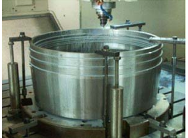
Combust Engine Cylinder