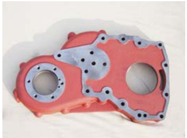
Flywheel Housing Body