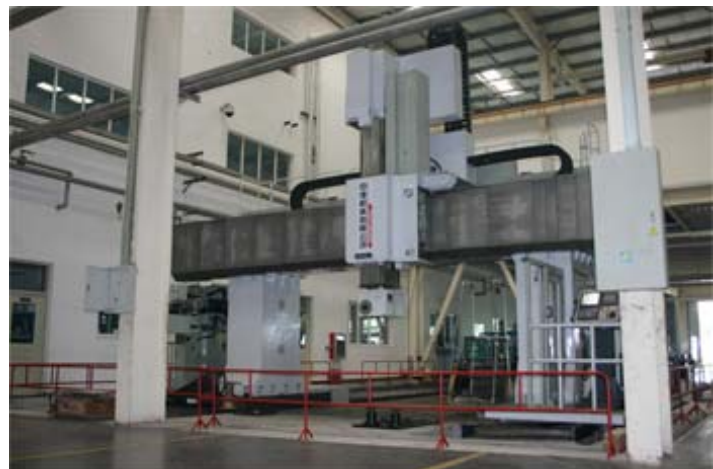
Frame Type Machining Center