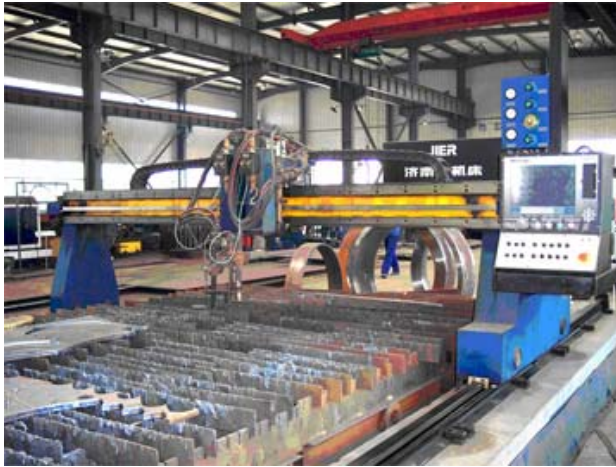
CNC Plasma Cutter