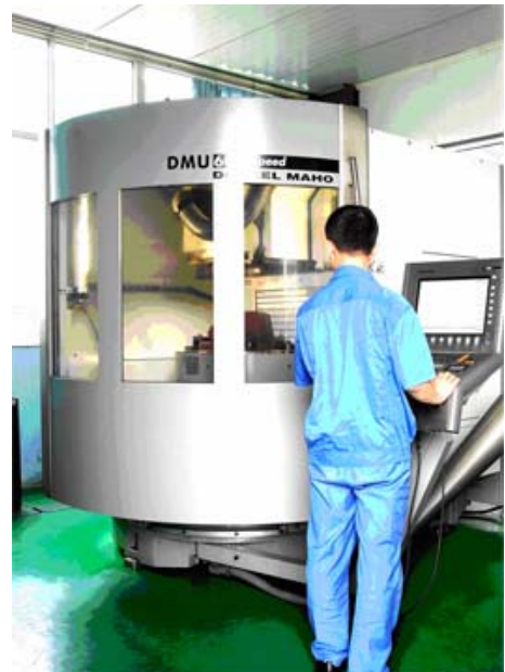
5-Axis CNC Machining Center